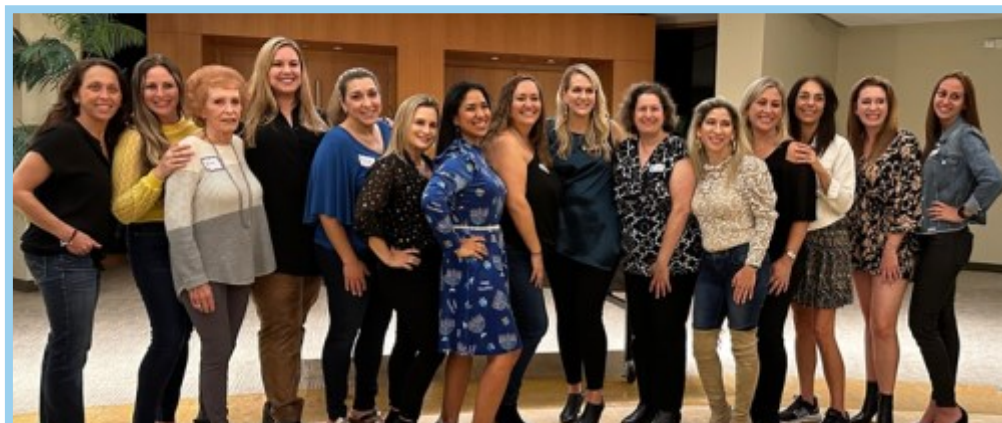
2022 - 2023 Sisterhood board at Latkes & Vodka Event