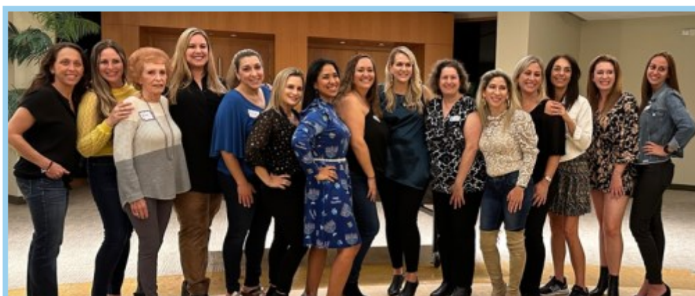
2022 - 2023 Sisterhood board at Latkes & Vodka Event